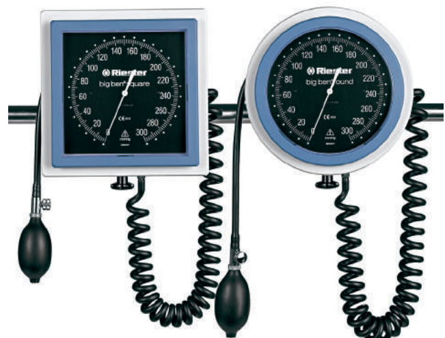
big ben® rail model

Chromium-plated screwed tube connection to allow quick changing of cuffs.