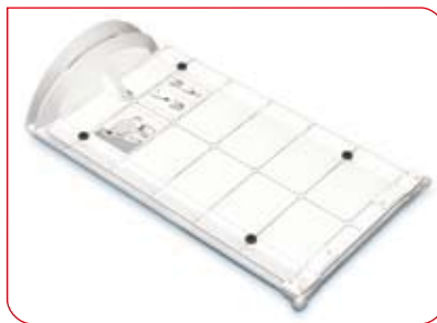
The high-quality folding mechanism guarantees a long service life.

The seca 417 stadiometer is ideal for mobile use. During regularly scheduled examinations, medical personnel check the nutritional condition and development of infants and toddlers. The process should go quickly, so it's important to be able to read results easily. The red markings and high-quality printing of the scale don't fade even after years of intense use.