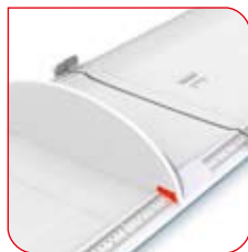
The measurement results are easy to read from the large scale.

A hinge joins together the two parts of the seca 417 measuring board. It has an integrated head piece and a separate foot positioner that smoothly runs along the gently raised guide rail. For a precise measurement, all the user has to do is place the head of the child against the head piece, stretch out the legs and move the foot positioner to the soles of the feet.